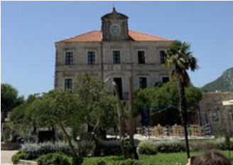
City Square, Ston, Croatia

While visiting Ston, on another day trip from Dubrovnik, we toured the Trsteno Arboretum. I thought it was really cool to find bamboo in Croatia. We also visited the Saltworks of Ston, which are the oldest salt pans in Europe and the largest preserved ones in the history of the Mediterranean. It was really interesting to see that they still harvest the salt as they have done for centuries. We watched the whole salt making process from pools of water, and I've never seen so much salt in my life!