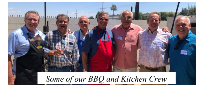
Some of our BBQ and Kitchen Crew